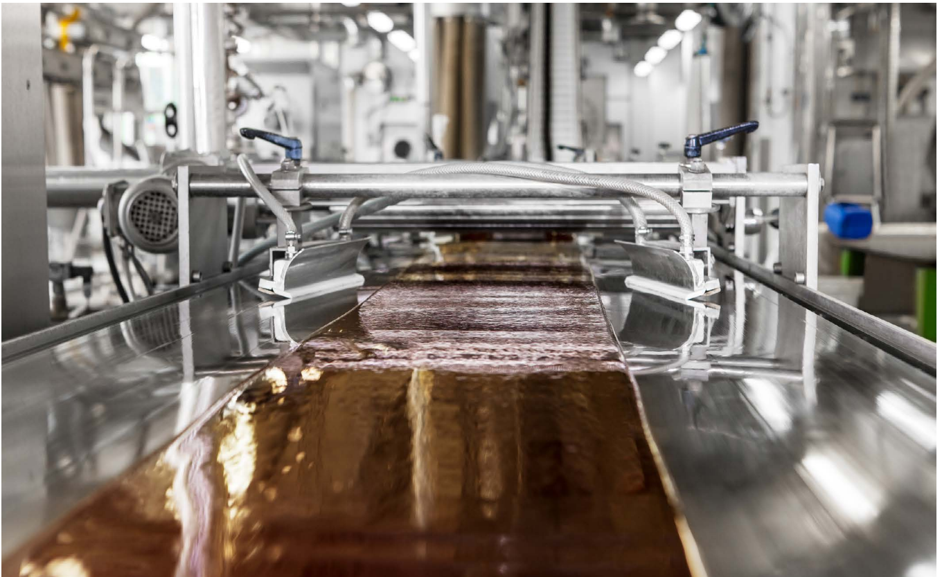
Production of Ricola herb drops