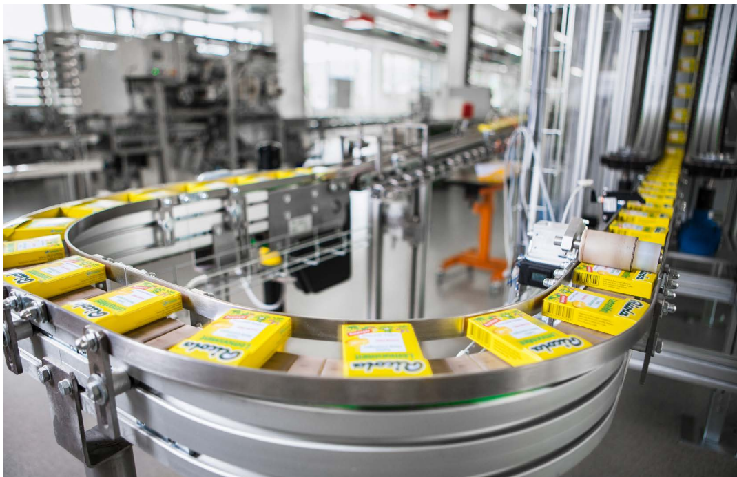
Production of Ricola herb drops

Moreover, a further cooking plant has been converted to ProLeiT every year since 2016; as things stand, three of the seven cooking plants still need to be integrated into the process control system. Burkart explains: “Using Plant iT as the basic structure, we have been able to develop standard software together with the plant manufacturer Bosch which we can implement in every future cooking plant. The main advantage for us is that it is now so much easier to integrate the three remaining cooking plants.” Burkart is clearly delighted with the greater level of control transparency for the cooking plant – “both through its centralised control and product-specific settings”. “While the previously implemented system was somewhat of a black box for us and the customer, Plant iT provides the operator and licence holder with a comprehensive overview.” From the individual process steps to the respective parameters, you can view everything, for example various cooking temperatures, pressures or speeds, and are able to adjust all the settings based on this overview. “Plant operation and control via Plant iT has become so much simpler and much more transparent.”