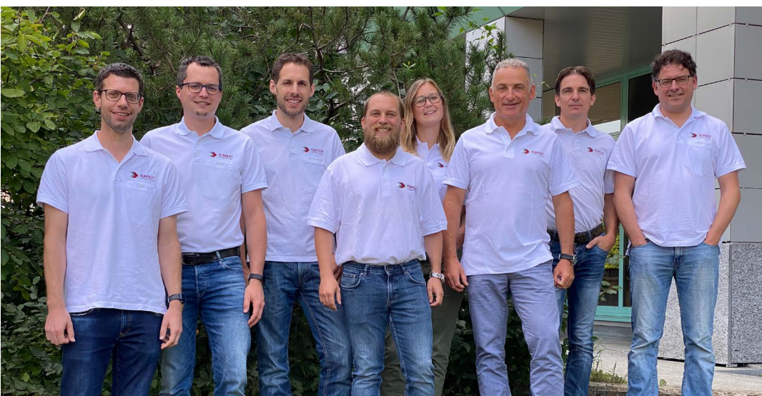
The Kundert Automation AG team

When it comes to the automation and integration of in-house production, the long-established company has been working with Kundert Automation AG since the early 2000s – a company initially founded as an engineering firm in Schlieren, almost 100 kilometres north-west of Zurich, in 1950. Since overhauling the production facilities in 2005 and 2006, Kundert has been the brains behind the automation concept for all Ricola production lines, and has supplied the required electrical engineering hardware and set up the corresponding control software.