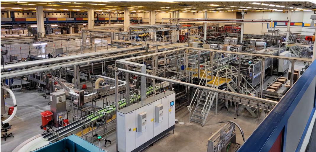
Filling at Hansa Borg

The process control system underwent a thorough modernization that included both the control cabinets and the I/O cards and has resulted in a cutting-edge plant.