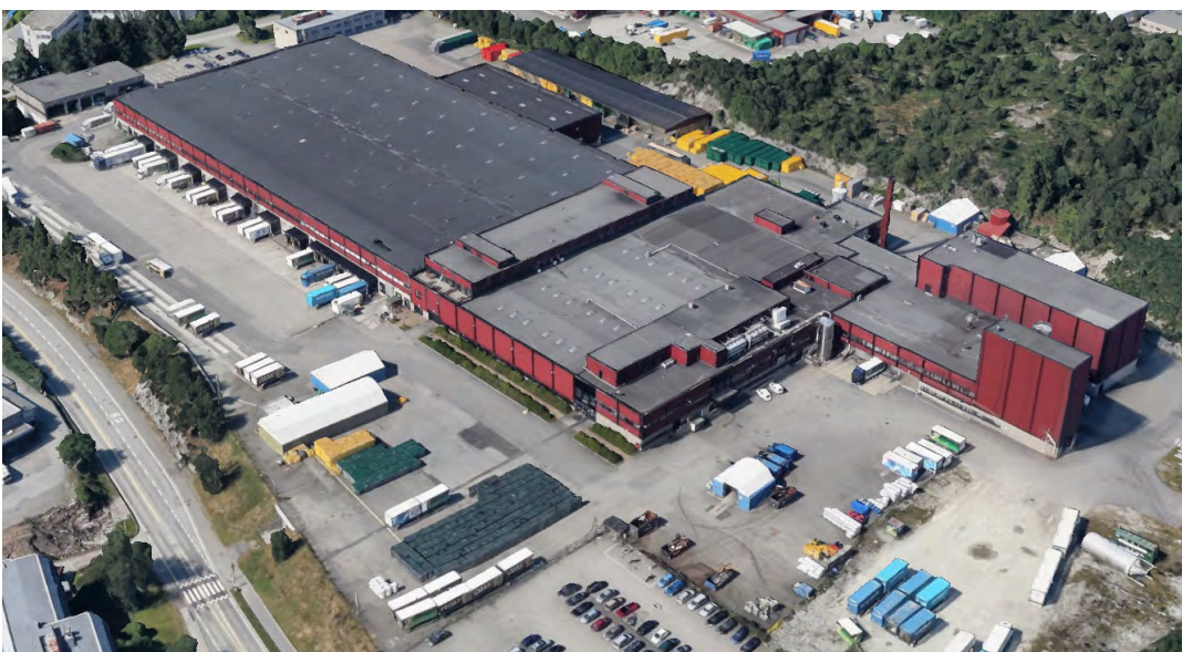
View of the factory