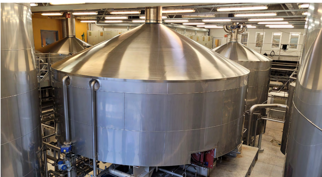
Hansa Borg Brewhouse

The central recording of all measurements, alarms, and messages ensures easy comparison and optimization options, leading to greater efficiency. Further, the central management of processes and parameterization through a sequence-controlled recipe system enable smooth and efficient production processes.