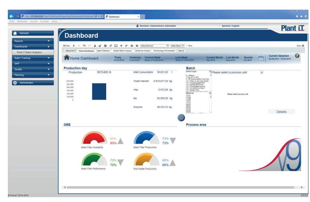
Faster overview despite a flood of information: clearly structured and freely configurable analysis dashboards enable fast and simple

Andreas Brülls: "The initial outlay obviously depends on the implemented solution, and it is, therefore, impossible to specify a one-fits-all price. The price may range from several thousand euros for small, compact solutions to a